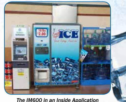
The IM600 in an Inside Application

Credit Card Only – For businesses that do not want their employees to have access to or responsibility for monies in the machine, the Credit Card Only option limits the form of payment for the ice to Credit Cards, similar to the Red Box® video kiosks.