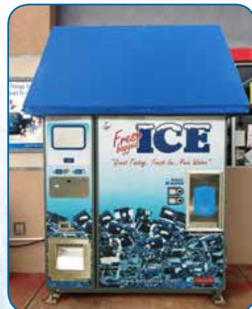
IM600XL Machine with Water Vending Station.