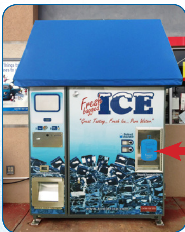
IM600XL Machine with Water Vending Station.