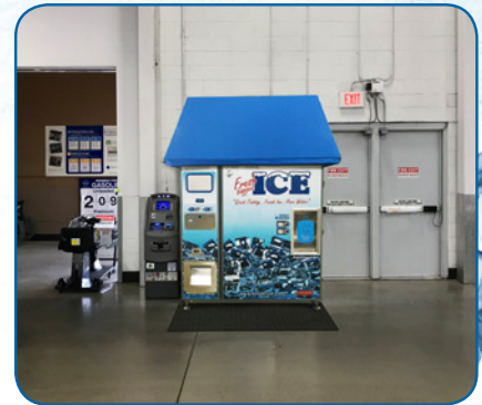
The IM600XL in an Inside Application

Credit Card Only – For businesses that do not want their employees to have access to or responsibility for monies in the machine, the Credit Card Only option limits the form of payment for the ice to Credit Cards, similar to the Red Box® video kiosks.