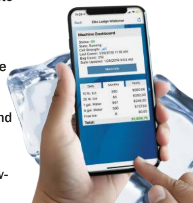
Our Remote Access Monitoring System as seen on an iPhone.

High Productivity + Lower Utility Costs = Higher Profits!