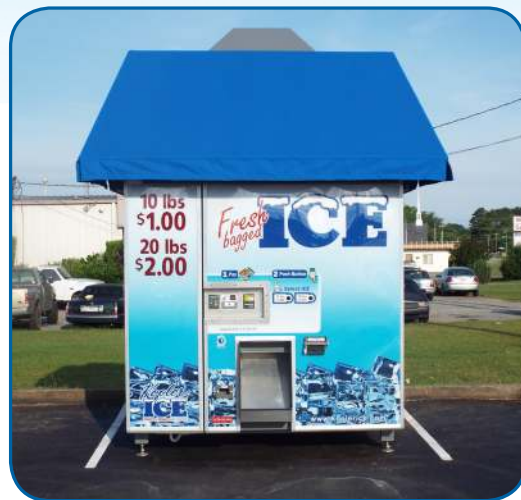
The IM2500 Series II has the highest production with the smallest footprint available in the industry today.

All of our machines comply with the new ADA requirements for consumer accessibility and, additionally, are NAMA certified and listed as complying with the federal guidelines for sanitation and consumer safety. Our machines are also ETL certified to UL541 standards for refrigerated vending machines to provide added safety for the owner and the consumer. And because the IM2500 Series II is considered a vending machine and has these important certifications, it is much easier to permit than a modular house that is considered a permanent structure.